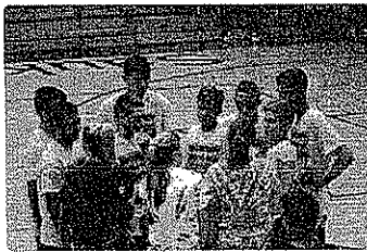
Peach Fuzz Volleyball